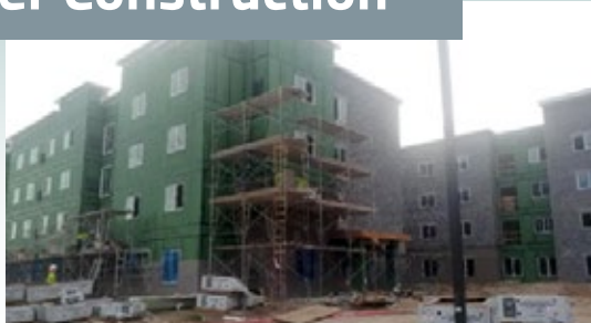
WaterWalk Dallas-Richardson, TX Opening February 2019