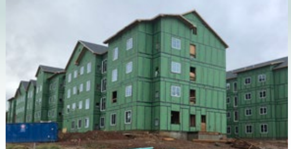
WaterWalk Overland Park, KC Opening May 2019