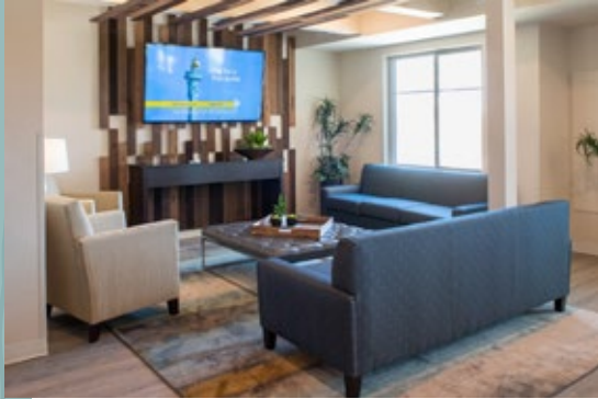
Lobby - media room