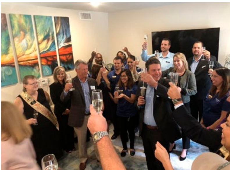
Celebratory champagne toast by the owners.